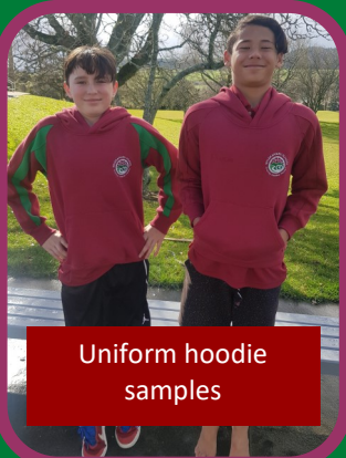
Uniform hoodie samples