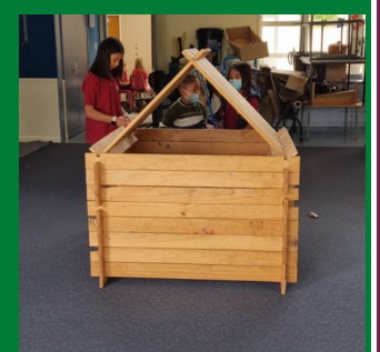
collectively working to set up the whare in R4 with Ms Whatarau