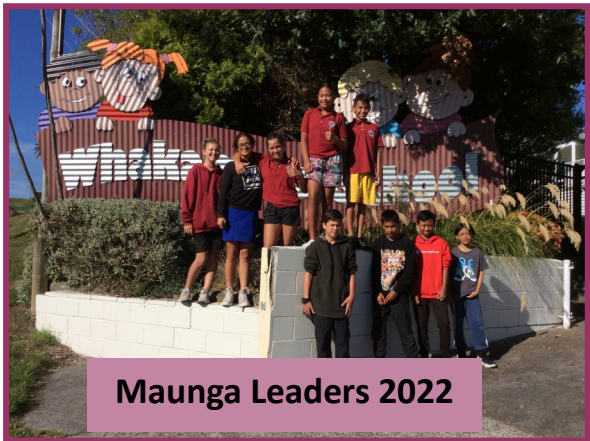
Maunga Leaders 2022