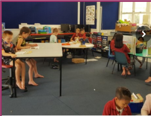
Fantastic morning with the juniors, silent reading, swimming and some phonemic awareness activities.