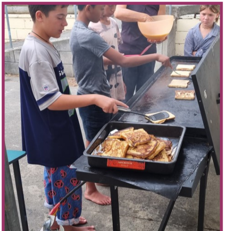
French toast anyone?