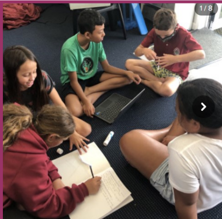
Te Whare Ako researching and finding answers to their questions about Te Tiriti o Waitangi and why it's a public holiday. Links to NZ Curriculum: English (reading/writing/oral language), Digital Technology (understanding how search engines work and how to filter), Critical Thinking, Cooperating, Communicating and Sharing Ideas