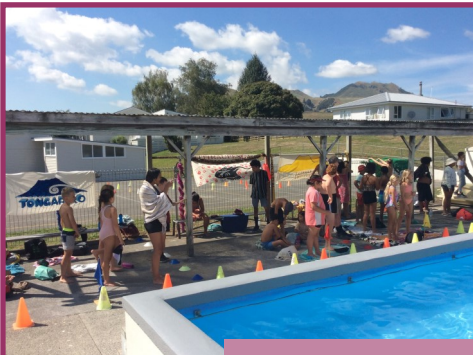
Senior Swimming Sport