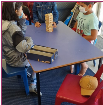
Talk about a battle of patience, skill and nerves...