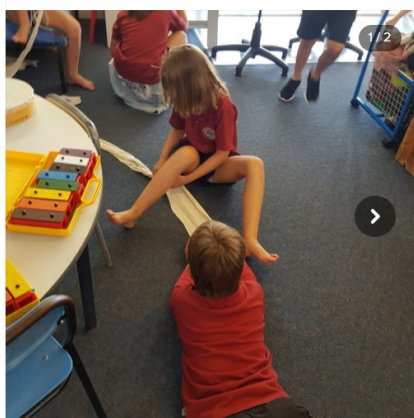
Some great examples of our KAAHU value Unified going on in Room 5. Well done everyone.