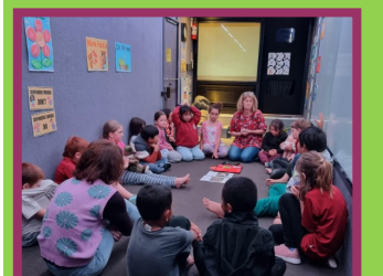
Life Education Bus