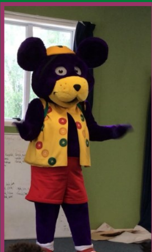
Reuben the Road Safety Bear

Principals message Tēnā koutou ngā whānau o te kura o Whakamaru.